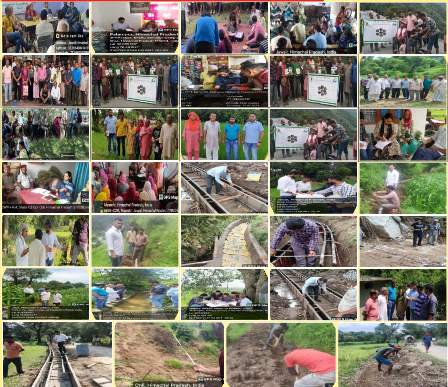
Progress w.r.t. KVA formation, Registration, Baseline Survey, SDP Preparation, Review by the PMC/SPMU and Endorsement from KVA Genral House upto July, 2023