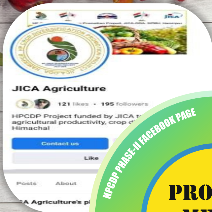
HPCDP PHASE-II FACEBOOK PAGE