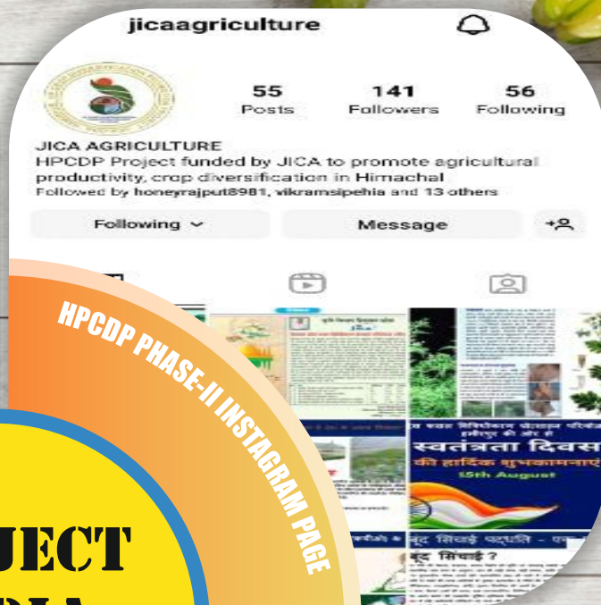
HPCDP PHASE-II INSTAGRAM PAGE