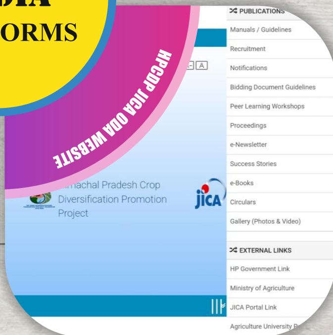
HPCDP JICA ODA WEBSITE