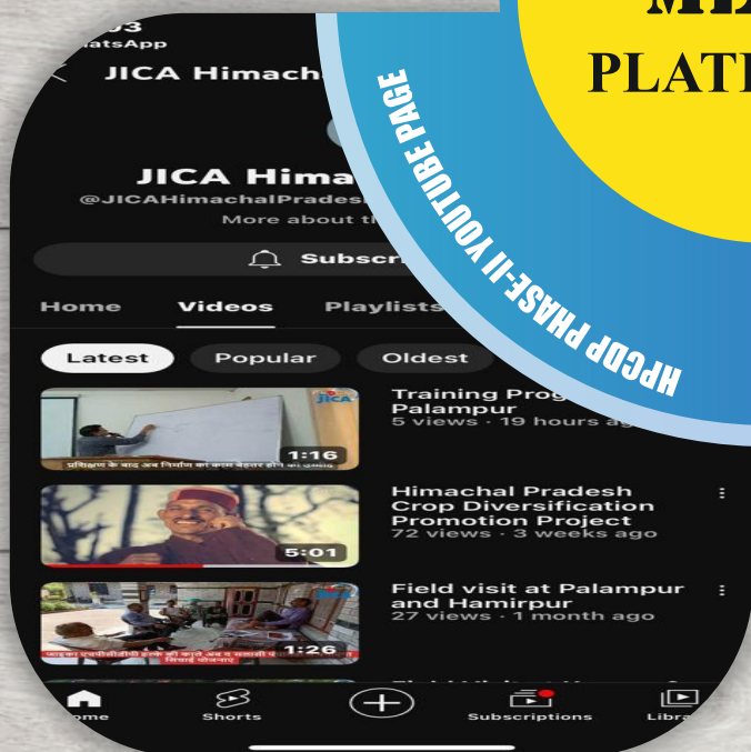
HPCDP PHASE-II YOUTUBE PAGE