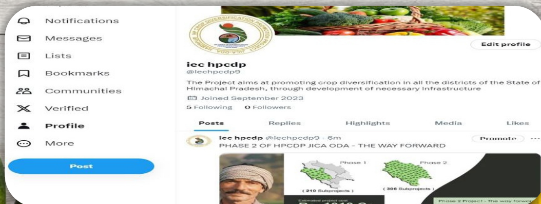
HPCDP JICA ODA TWITTER PAGE